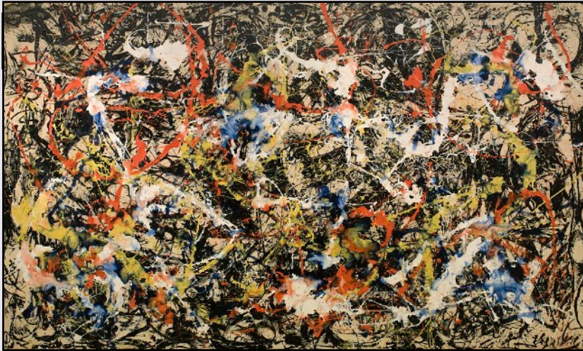
Jackson Pollock abstract expressionism

Claim: The surest indicator of a great nation must be the achievements of its rulers, artists, or scientists. Reason: Great achievements by a nation's rulers, artists, or scientists will ensure a good life for the majority of that nation's people.