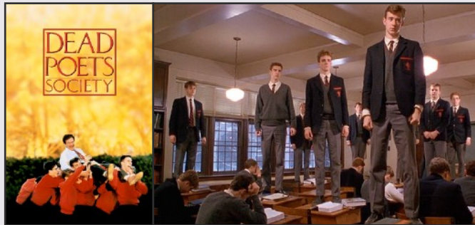
Mr. Keating in Dead Poets' Society