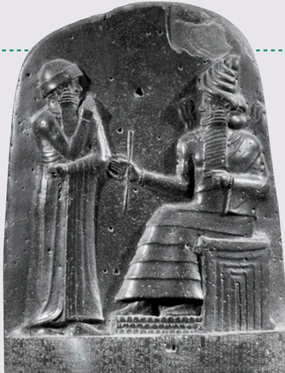
The Code of Hammurabi