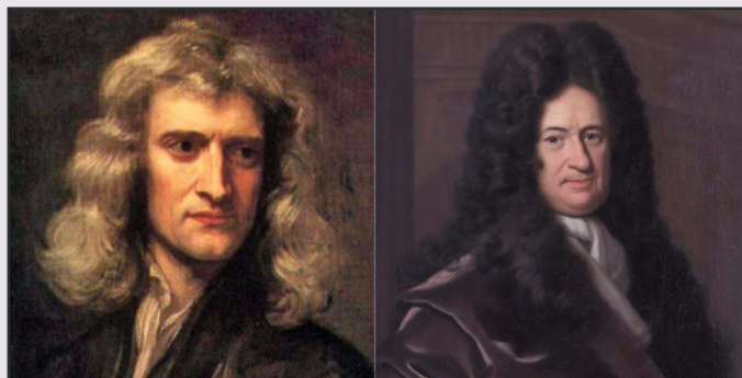
the invention of calculus